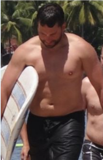
2013 Age 36 240 lbs.