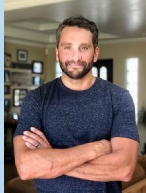
2019 Age 42 200 lbs.